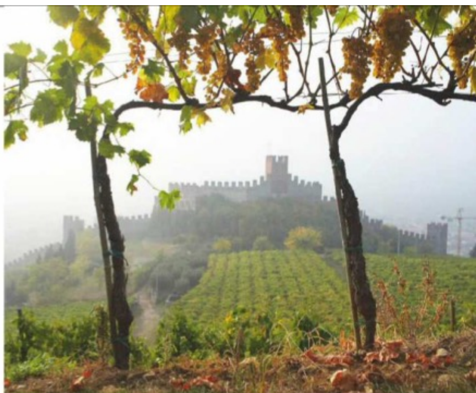
Above: all of Pieropan's 46ha of vineyards were certified organic in 2015