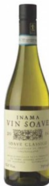
Below: Inama's Soave Classico 2016

Gini vinifies its Soave cru in oak barrels, most of which are old, and without sulphites (they add a small amount just before bottling). They believe indigenous yeasts result in fewer stuck and better fermentations and, in the absence of sulphites, this results in more refined wines. They emphasise the importance of impeccable hygiene in the cellar to work